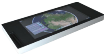
DU49C-TR (Table-Ready display)

The Flo-Thru table design offers striking housing along with a hidden access panel for running cabling and hiding small form-factor PCs or other devices.